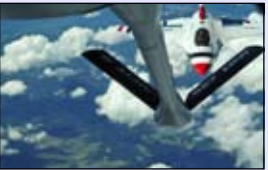
Week in photos: page 4 Images from MacDill