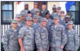
Community: page 17 Events, Chapel, more...