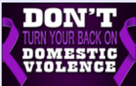
News/Features: page 3 Domestic violence part II