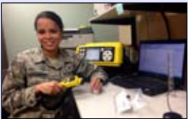
Diamond Sharp: page 6 Special job opportunity