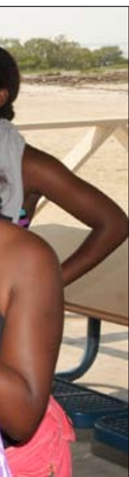
ly cardboard, had two ways t.