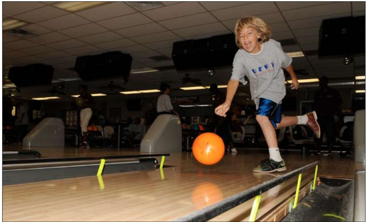
DEFY participants built teamwork at the base bowling lanes, where children like this boy gathered June 9 to take down pins, while raising camaraderie and competitive spirits.