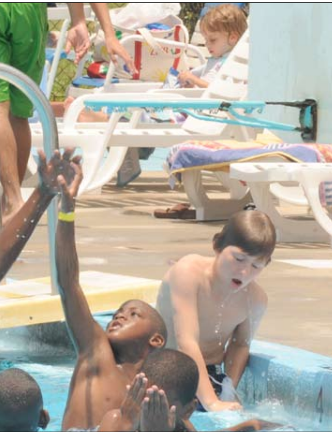
base pool during DEFY June 11. DEFY is a summer of alcohol, drugs and peer pressure.