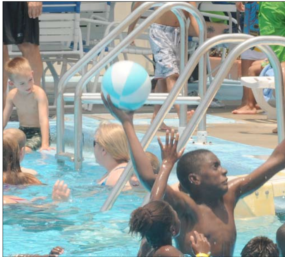
Children of the Drug Education For Youth Program play basketball at the camp that educates children of servicemembers about the negative effects of drugs.