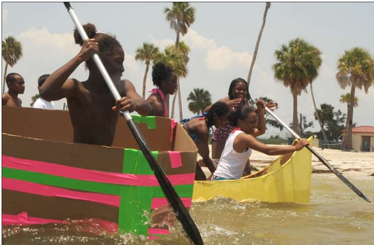
DEFY campers test their skills in the water during the cardboard boat regatta June 10. DEFY campers and mentors built boat using only cardboard, duct tape and paint.