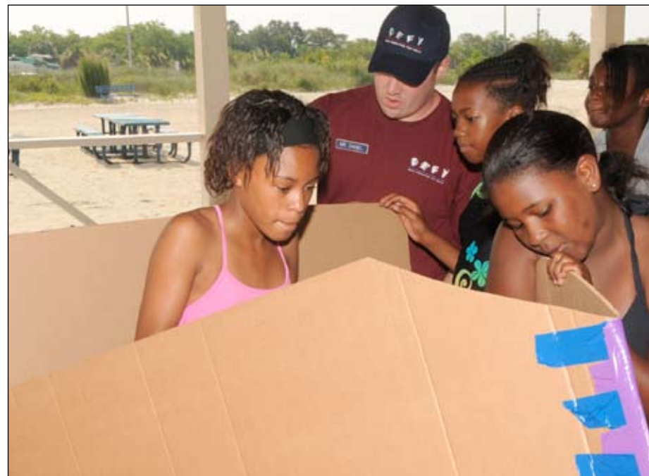
Drug Education For Youth Program (DEFY) kids build a boat using cardboard boxes, duct tape, and paint during the DEFY Boat regatta June 10. Campers will compete to win the regatta — have the fastest boat or the longest floating boat.