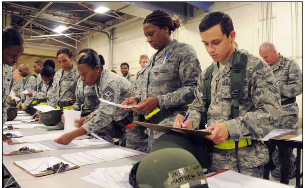
Members of the 927th Air Refueling Wing review the contents of mobility bags as they prepare to pick up gear for a mock deployment.