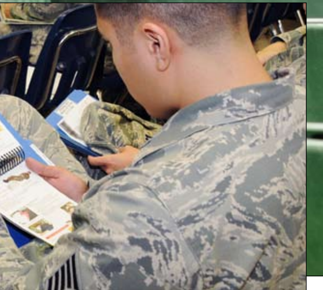
as she processes through a mobility line June 2, simulate a deployment. (Inset from left to right) Staff of the 927th Air Refueling Wing chaplains, were on a mobility line, and a member of the 927th Air