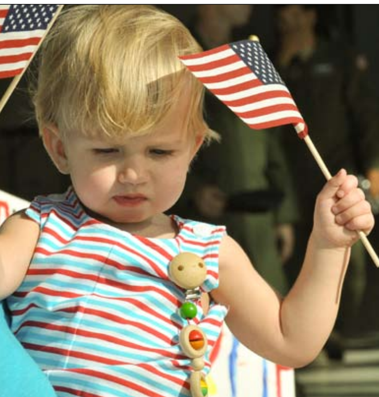
...anticipation of the arrival of the C-37A carrying her hus- quadron pilot, and other crew members April 2 at MacDill the 310th AS volunteered for a three-month deployment.